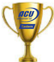
2025 Club Championship